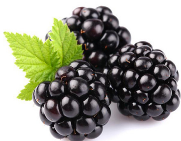
Kupina ( Rubus fruticosus ) Blackberry