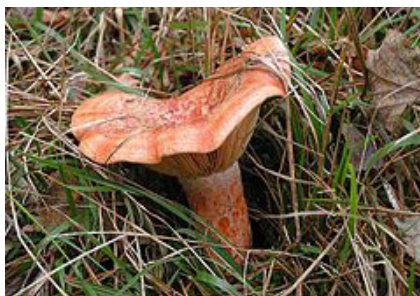
Rujnica (Lactarius deliciosus)