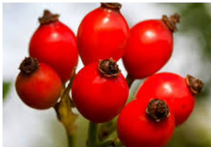
Šipurak (Rosa canina)