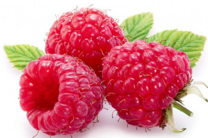
Malina ( Rubus idaeus ) Raspberry