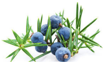
Kleka (Juniperus communis)