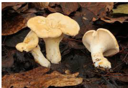
Žuta ježevica (Hydnum repandum)